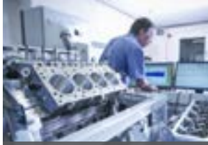
Engine & transmission test beds