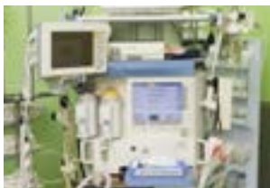
Calibrating medical equipment