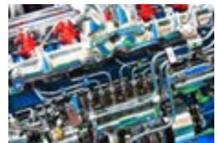
Measuring intake & exhaust gas pressures