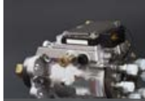
Fluid pump pressure measurement