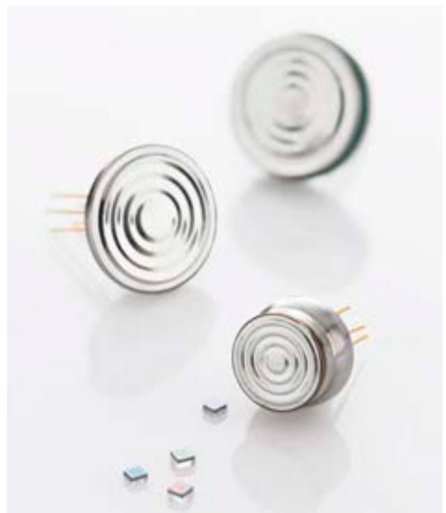
Reliable core technology: Piezoresistive measuring cells